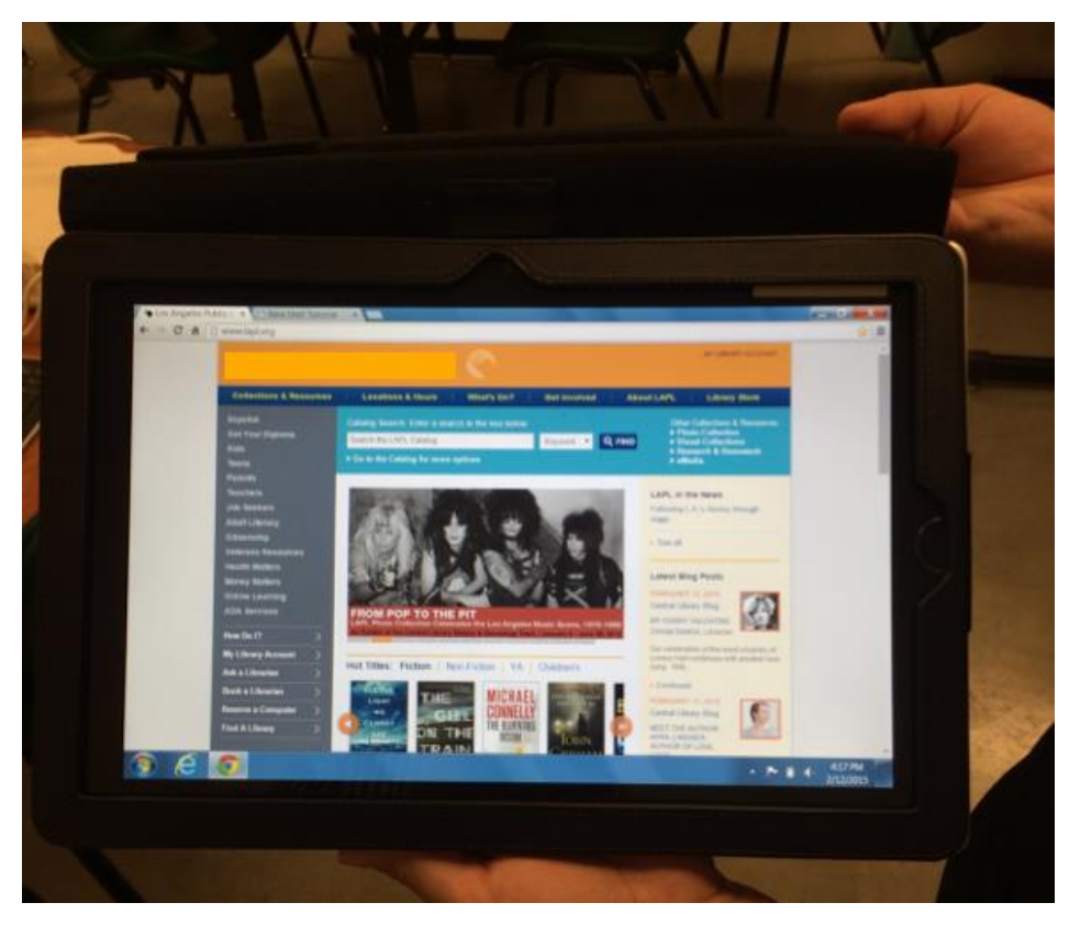
Figure 2. A library paraprofessional demonstrates how to use an online public access catalog to Accesso Libre's students using a computer donated by a corporate sponsor.

The first (and final) Accesso Libre class took place on February 12, 2015. At the designated start time, the instructor explained to the 12 adults assembled in a classroom that the class would need 25 students or could not run ("No va," she joked). Already, the future of the class was in jeopardy because not enough parents in the community had agreed to participate. A librarian, a library paraprofessional, and a student volunteer from a local high school served as facilitators for the 12 students. All but one of the students were women. Two students brought children with them, a reflection of the highly circumscribed and gendered aspects of childcare in the community. The instructor asked the class if they wanted her to speak in English or Spanish. Unanimously, the class asked for Spanish instruction. Agreeing to the request, the instructor asked (in both English and then immediately in Spanish) what kinds of things the class might like to do with computers. No student would provide an answer. Graciously accepting the silence of the class, the instructor promised she would take questions in Spanish at any time and respond in both Spanish and English. This would be a class "sin estrés" ("without stress"), she explained.